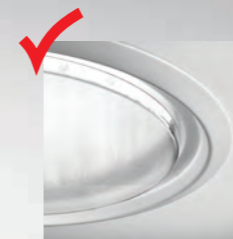
New look Edge Glow