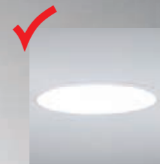
Easier to clean