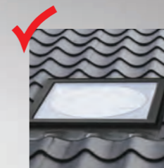
Easier to install