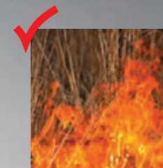
Improved BAL rating